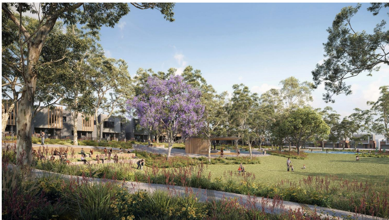
Figure 7 Indicative photomontage of new public park and terraces