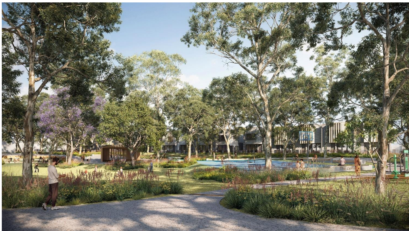
Figure 6 Indicative photomontage of the proposed public park and terraces