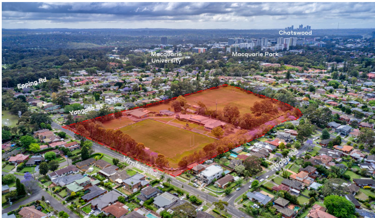
Figure 2 Oblique aerial image looking north-east