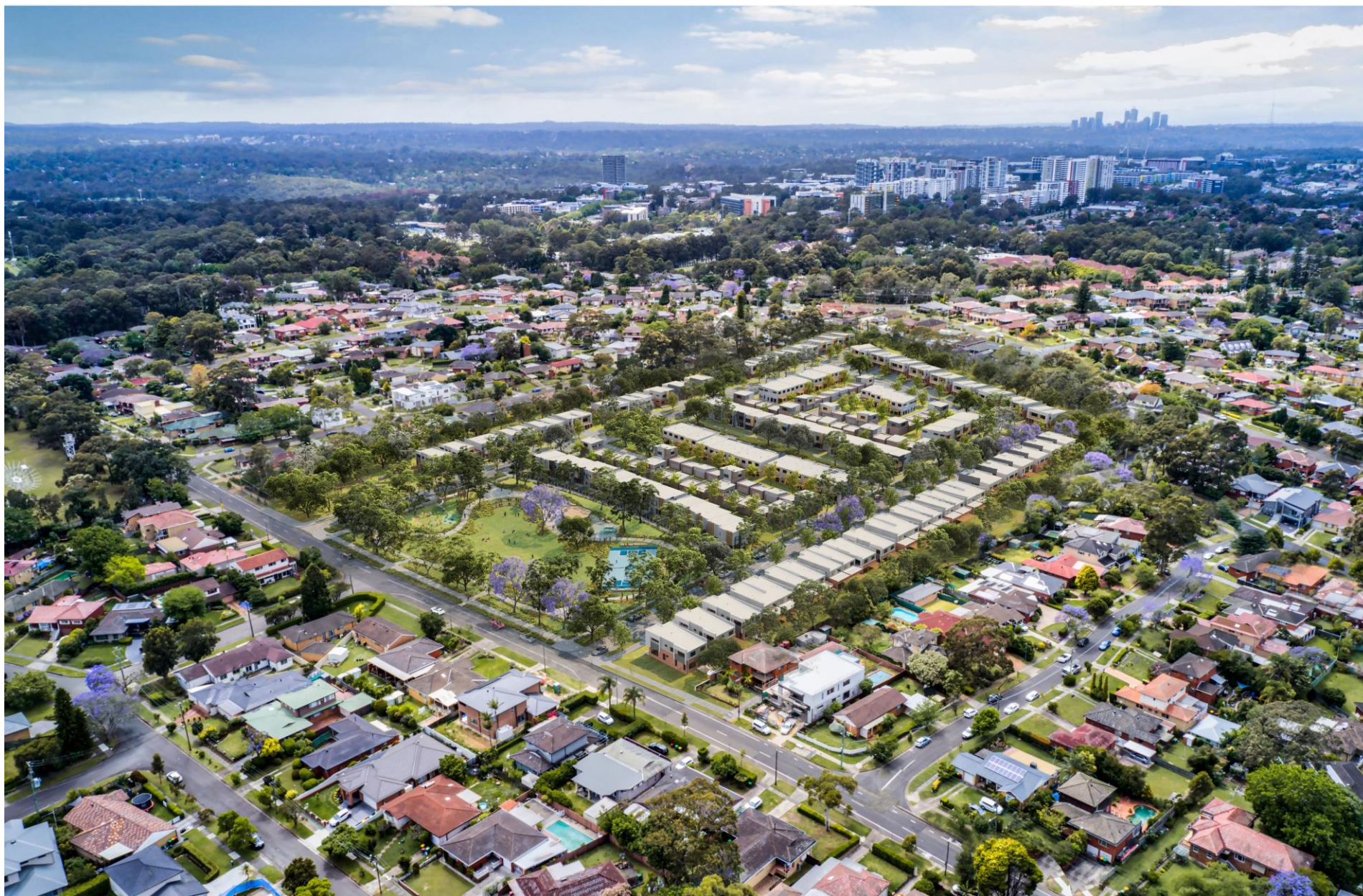
Figure 8 Indicative photomontage of proposed development