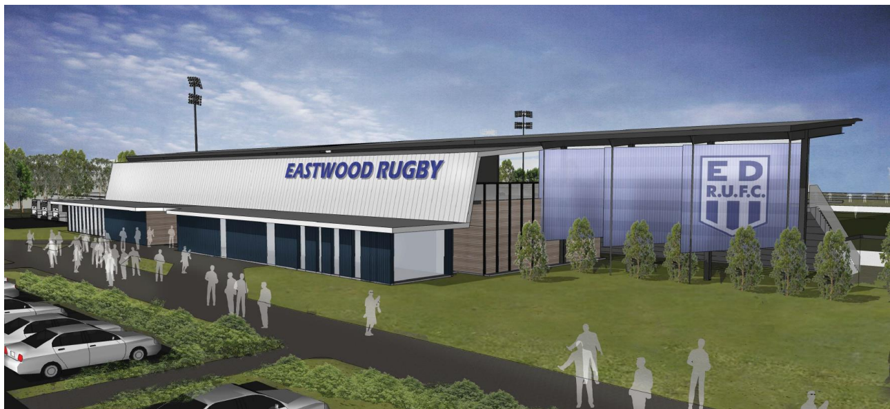
Figure 3 Indicative site plan and render of new Eastwood Rugby facility at Fred Caterson Reserve